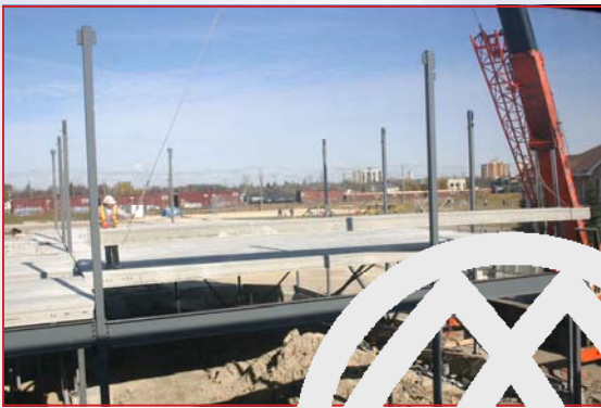
Construction on the northeast quadrant: top to bottom - pouring concrete grade beams; installing structural steel; installing concrete hollow core.

Linden Christian School will be a biblically-based learning community where all students grow to be devoted followers of Christ, insightful thinkers, discerning decision-makers, and compassionate community members.