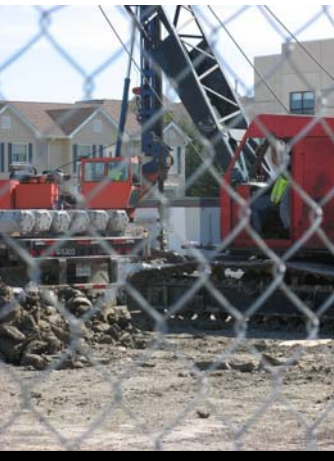
Stages of construction | July-October, 2010: construction fence installed; HQRs (high quality re-locatables) are relocated ; foundation work, including the installation of precast piles and concrete work.

Construction is underway. The following is an approximate timeline of events related to completion of the northeast quadrant. This timeline covers the months of October and November 2010. You can follow construction news online at lindenchristian.org .